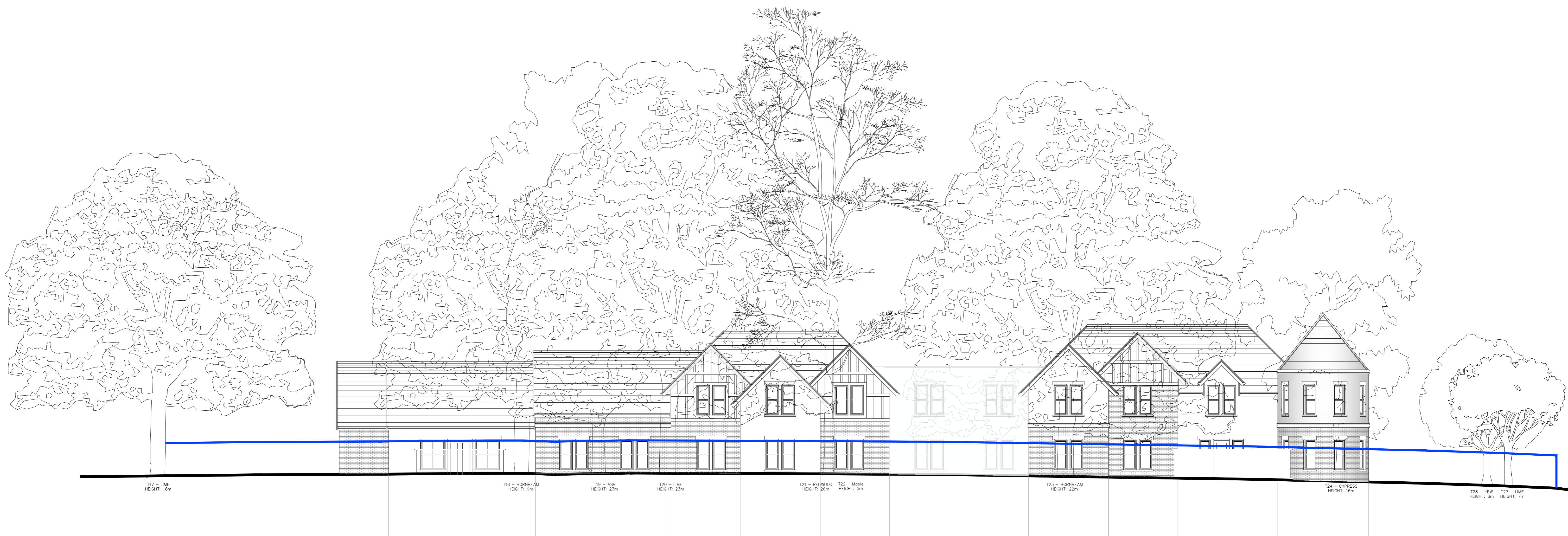
Proposed South West Elevation