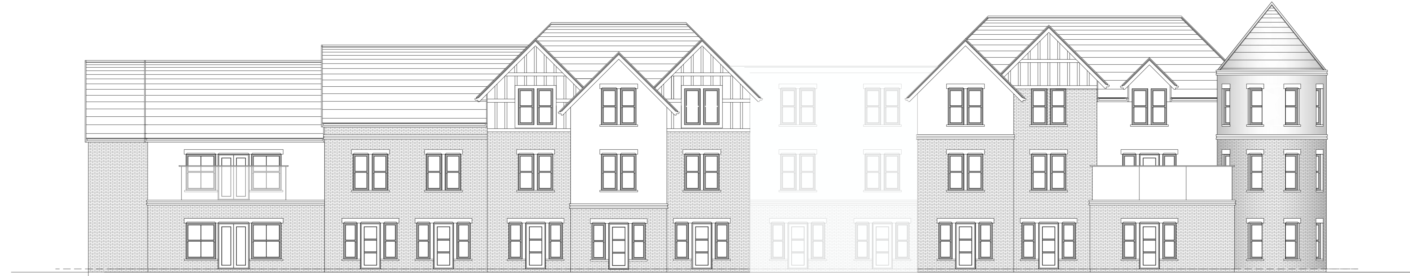
Proposed South West Elevation